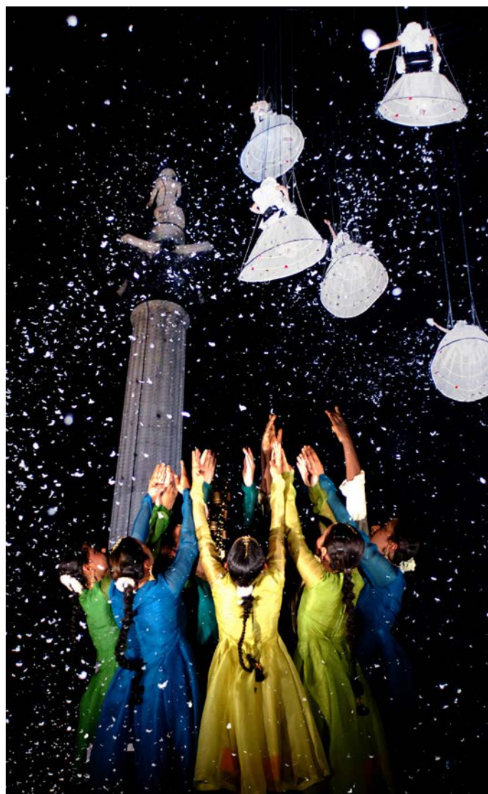
Bells (2007)

We are passionate about taking our work to disadvantaged communities and those who may never have experienced live dance performance. We also serve the growing South Asian community in London – the capital's second largest minority population – offering meaningful connection with Indian cultural traditions in a cosmopolitan British context.