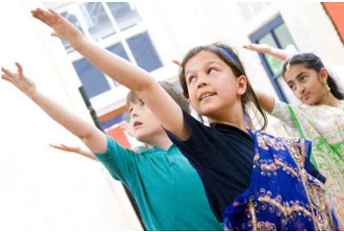
Akademi's Learning and Participation work.