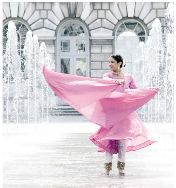
Waterscapes (2004)

PERFORMANCE: to be the leading producer of South Asian dance across classical, contemporary and popular forms, growing audiences by taking work to new places, building strong local, national and international partnerships, and using technology to deepen engagement and widen reach.